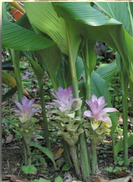
郁金(鬱金) Curcuma aromatica

The Ginger Lily, with white and fragrant blossoms, is one of the best-loved cut flowers in Hong Kong. While the Ginger is well known to every family for its rhizome which is a popular condiment for cooking Chinese dishes and the traditional medicine.