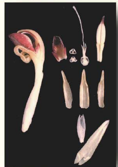
生薑花的構造 The structure of ginger flower

If a plant has the above-mentioned characteristics, it undoubtedly belongs to the ginger family. The structure of ginger flowers is also very specific: besides the calyx and corolla, the showy part of the flower usually is the staminodes and only one fertile stamen exists.